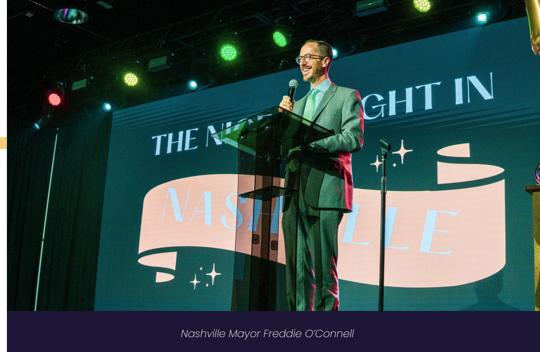
Nashville Mayor Freddie O'Connell

Table Arrangements by Sunny Ridge Flowers